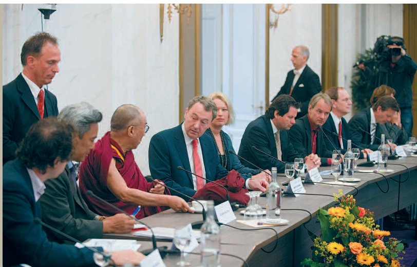
His Holiness meets with Dutch parliamentarians.