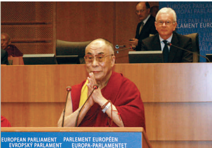
His Holiness appears before the European parliament.