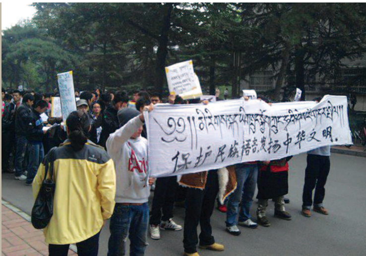
Chinese demonstrate in Beijing over China’s media policy.

ICT continued its determined support of the dialogue between envoys of the Dalai Lama and Chinese officials, the most recent round of which took place in early 2010. We were greatly encouraged in this process by the meeting between His Holiness the Dalai Lama and President Barack Obama in February 2010.