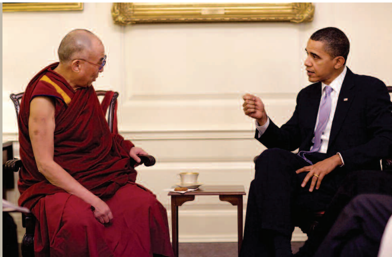
His Holiness meets with President Obama in February.