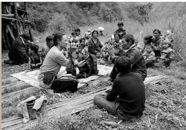
A 2010 Rowell Fund grantee interviews Tibetans for this funded project.