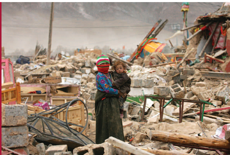
A Tibetan mother carries her child through rubble following the earthquake in Yushu.

2010 saw a significant increase in gifts brought in online. In 2009 we received $112,770 in online gifts and in 2010 that number jumped to $355,725. Going forward, we will continue to ensure our supporters can donate in the medium most convenient for them.