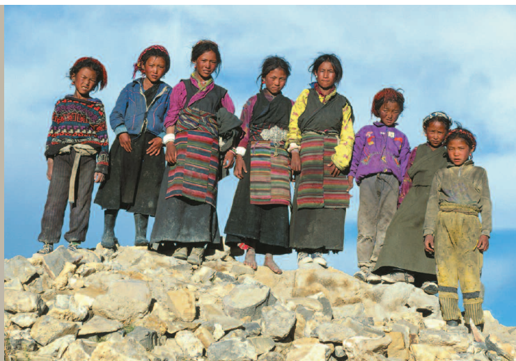
Tibetan refugee children gather on a hillside.